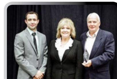
Environmental Leader Award Regens Disposal Sponsored by SaskPower