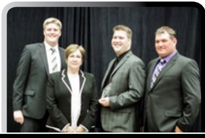
Growth and Expansion Award Gilliss Casing Services Sponsored by the Estevan Chamber of Commerce