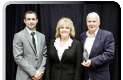
Environmental Leader Award Regens Disposal Sponsored by SaskPower