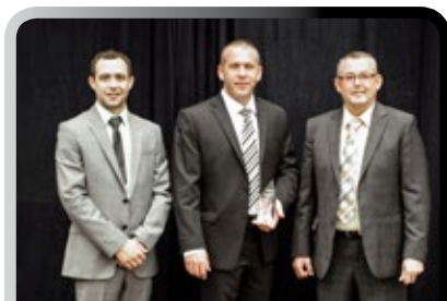
Community Involvement Award Power Dodge Sponsored by Regens & Turnbull