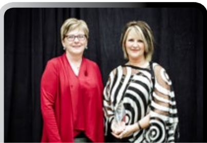
Outstanding Service Award Estevan Nutter's and Bulk Foods Sponsored by Access Communications

The Estevan Chamber of Commerce ensures that any information you may provide will remain confidential.