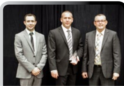
Community Involvement Award Power Dodge Sponsored by Regens & Turnbull